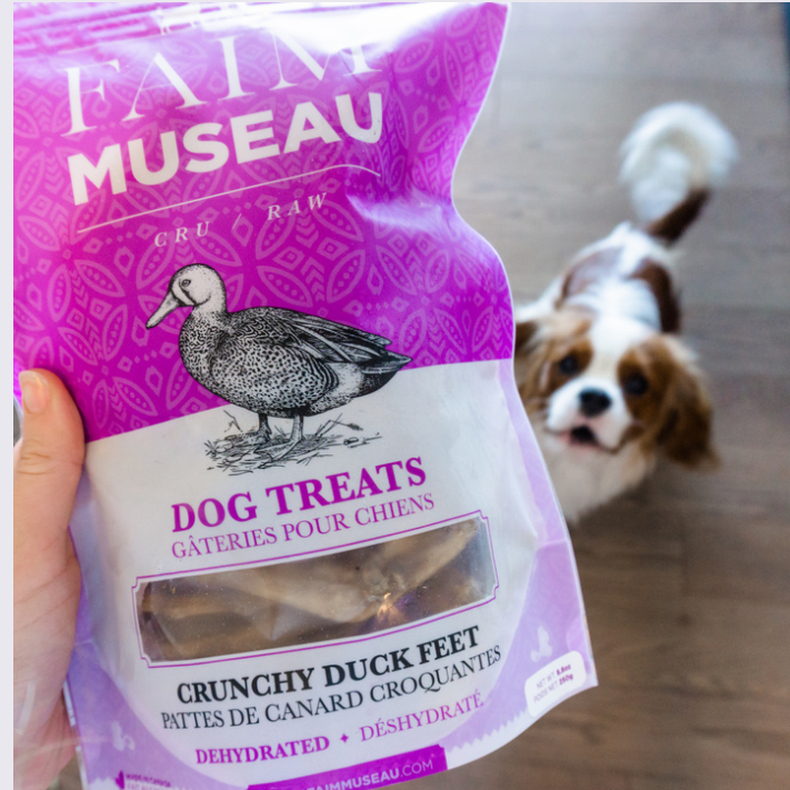
Paid partnership with Faim Museau (raw dog food)