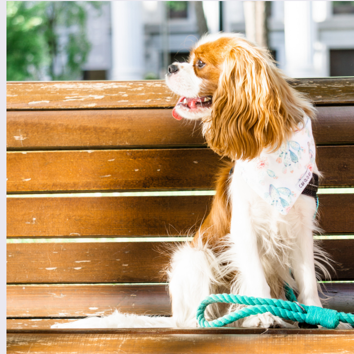
Ambassador content for Cavology (dog apparel and accessories)