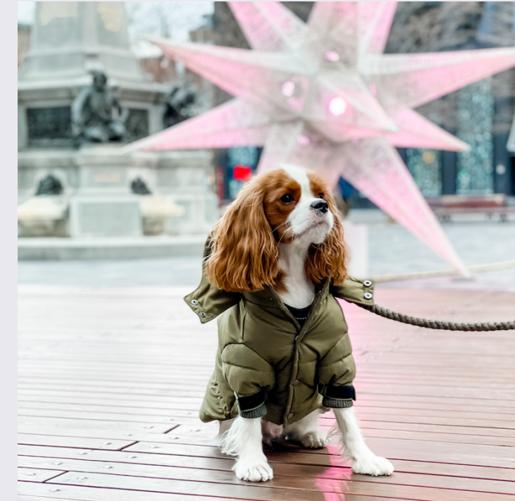
Affiliate-ambassador content for Maxbone (high-end dog apparel)