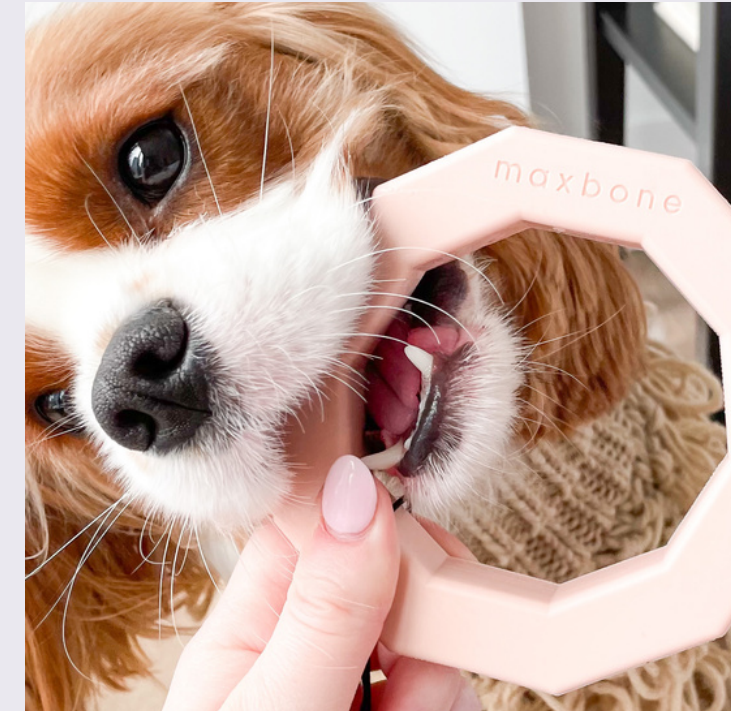
Affiliate-ambassador content for Maxbone (high-end dog apparel)