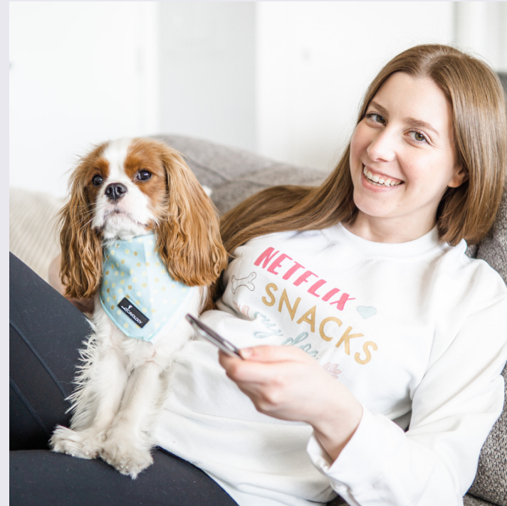
Ambassador content for Cavology (dog apparel and accessories)